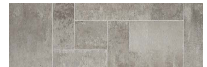
212815 Concrete Grey