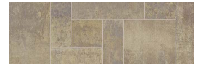
212816 Concrete Taupe