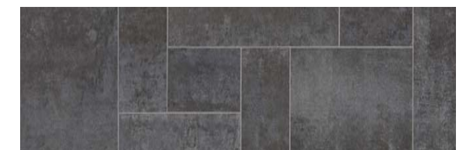
212819 Concrete Slate