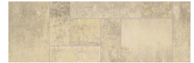
212818 Concrete Beige