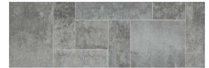
212813 Concrete Blue